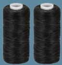
8/4 Waxed & Double-Waxed Thread