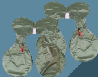
LPU Right & Left Bladder

For more information or questions regarding procurement, please contact: Info@tiax-llc.com .