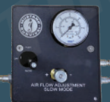
Control Box (EPL Test Kit)