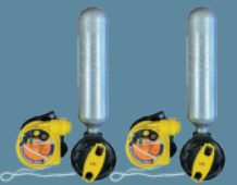
Automatic Life Preserver Inflation Units (ALPIUs)