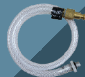
Threaded Hose Adapter w/ O-ring*